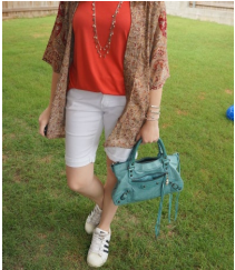
Bermuda shorts Must be 3" from the knee.

CFMS WILL CONDUCT A DRESS CODE SCREENING PRIOR TO DEPARTING FOR GRADVENTURE.